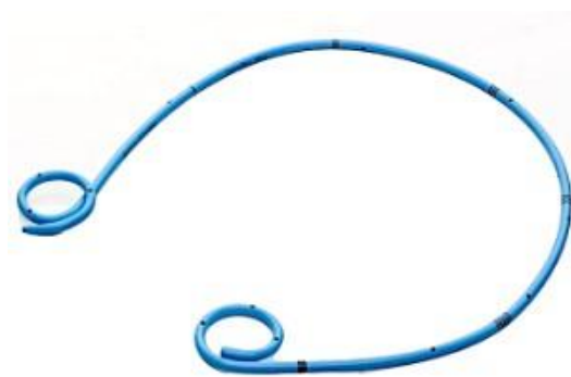
A ureteric stent

While you have a ureteric stent, you may have: